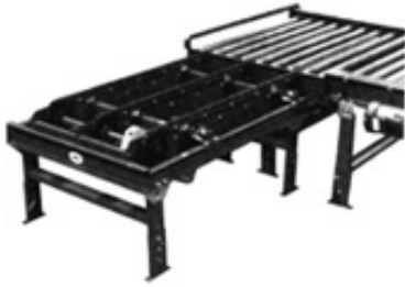
Model TTF - 3 Strand Through-The-Frame Chain Transfer

Three-strand chain transfer mounted in a Model 48 (Roll-to-Roll Chain Driven Live Roller Pallet Conveyor)