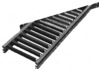
Straight Spur 45° and 30° (3" Roller Centers Only)