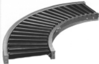
Tapered Roller Curve 90° and 45° (3" Roller Centers Only)