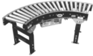
Model 35 - Belt Driven Live Roller Curve