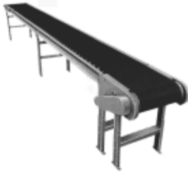
Model 20 - Horizontal "System" Roller Bed Belt Conveyor